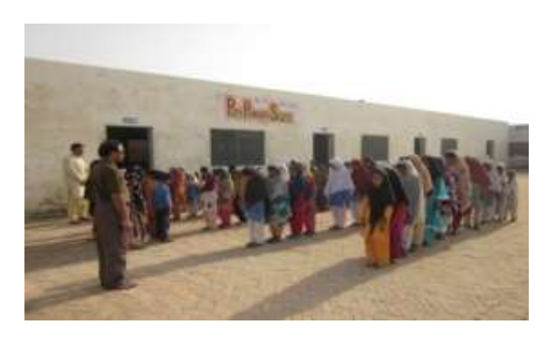
Fig. 9 Primary school in Noor Ghazi