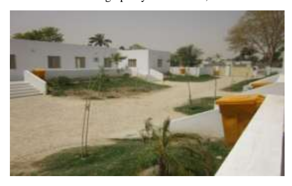
Fig. 17 Primary School in Miani Mallah