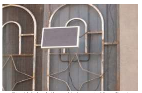
Fig. 12 Solar Cells outside houses in Noor Ghazi