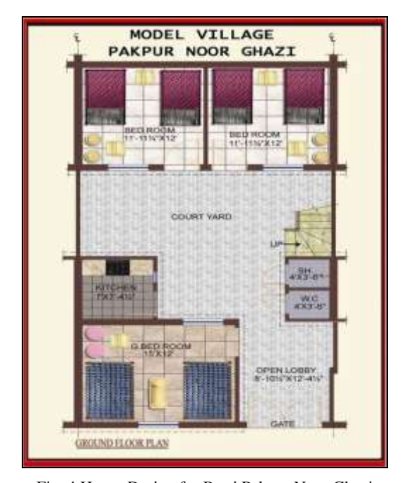
Fig. 4 House Design for Basti Pakpur Noor Ghazi

Table 3 shows the provision of various utility services and public facilities as well as the satisfaction level of the families residing in the rehabilitated settlements. Most of the utility services like electricity, water supply, sewerage and drainage system, and facilities like parks and open spaces, schools and vocational training centres have been provided in both of the case study settlements (See Photographs in Appendix-A Figures 6 to 21).