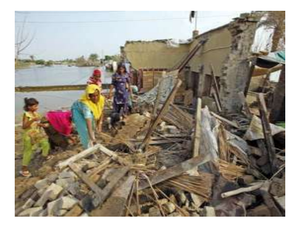
Figure 2: Villagers recover goods from their houses destroyed by 2010 flood in Muzaffargarh

Different clusters were formed to provide for relief and early recovery needs in more effective manner. The clusters include: agriculture, camp coordination and camp management, coordination and support services, education, food, health, logistics and emergency telecommunications, nutrition, protection, WASH (water, sanitation and hygiene), community restoration and shelter/non-food items. The community restoration cluster attempted to rehabilitate critical infrastructure and restoring access to basic public services like education and health facilities as well as employment opportunities. The