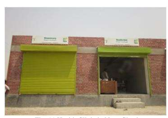
Fig. 11 Health Clinic in Noor Ghazi