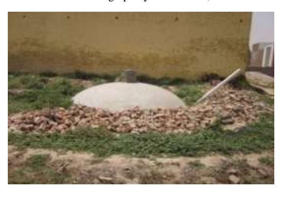
Fig. 20 Biogas plant in Miani Mallah