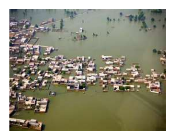
Figure 1: Aerial view of Rajanpur submerged in 2010 flood waters