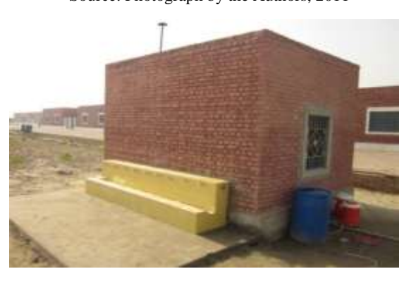
Fig. 8 Water filtration plant in Noor Ghazi