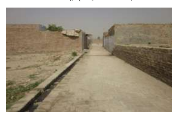
Fig. 19 Brick paved street in Miani Mallah