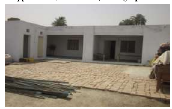
Fig. 14 Two room house in Miani Mallah