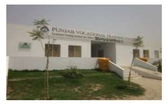
Fig. 21 Vocational training institute in Miani Mallah