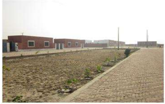
Fig. 7 Open space and brick paved street in Noor Ghazi