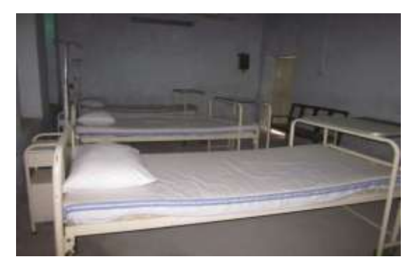
Fig. 15 Dispensary in Miani Mallah